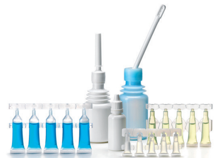
Single and multi-dose packaging solutions