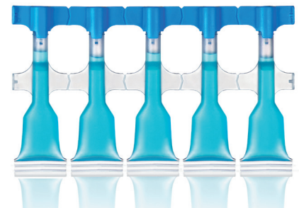
Custom solution packaging